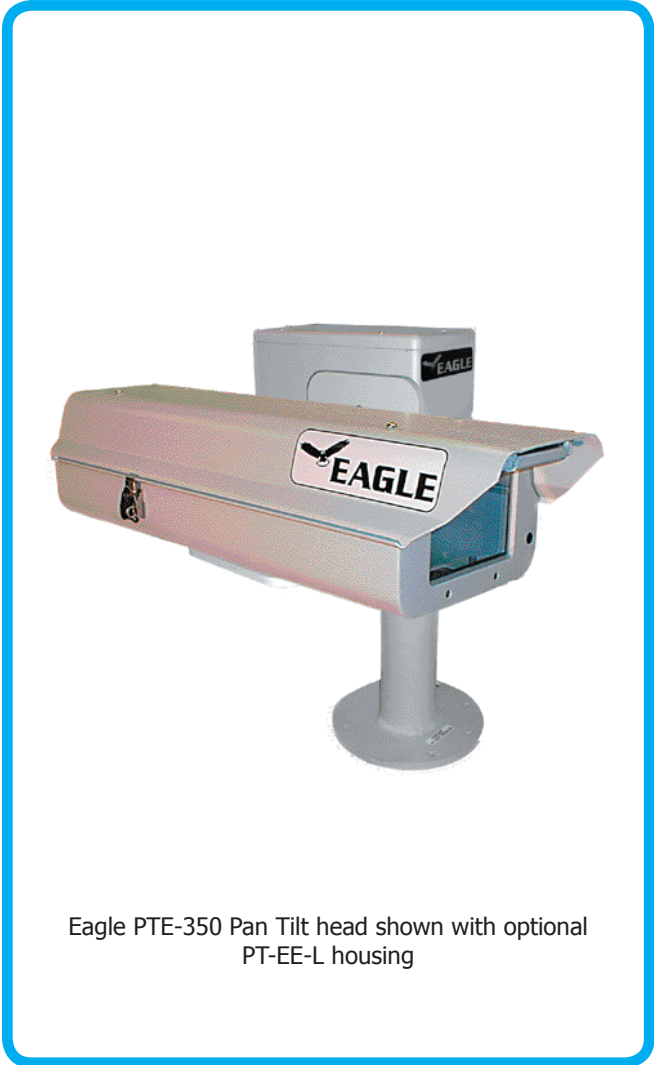
Eagle PTE-350 Pan Tilt head shown with optional PT-EE-L housing