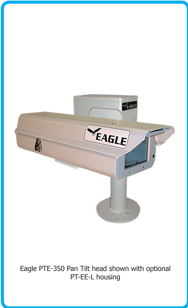
Eagle PTE-350 Pan Tilt head shown with optional PT-EE-L housing

Highly water and wind resistant construction for maximum equipment protection