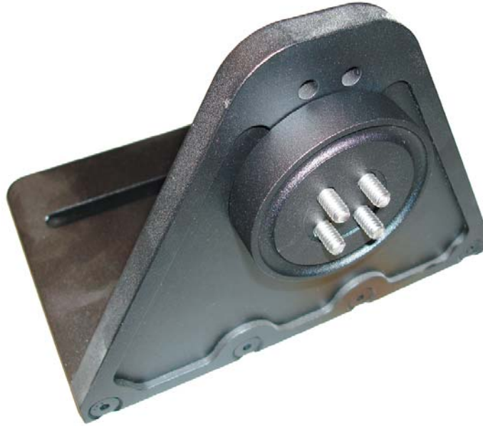
PT-250 camera bracket with spacer and bolts inserted

Assemble camera/lens combination. Find the center of balance of the camera/lens assembly and note its location. Attach camera/lens system onto camera bracket using the supplied 1/4"-20 fasteners. Do not completely tighten the fasteners until after the next step.